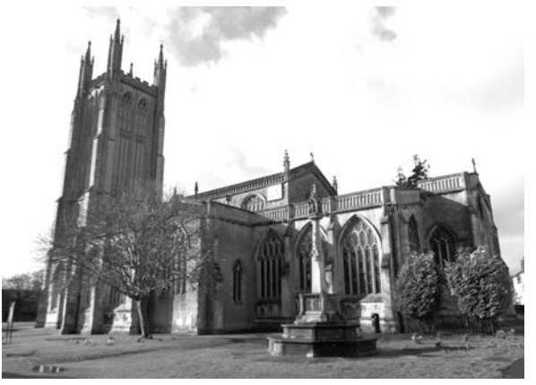
The City Memorial