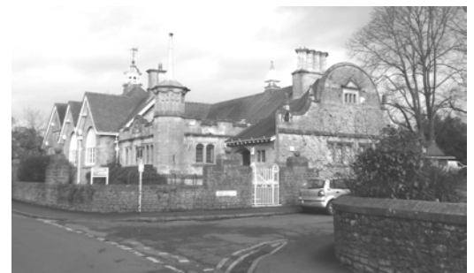
Somerset Skills and Learning Centre.

Since moving to Kennion Rd the building has become a teaching resource and now the