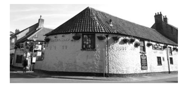
And back to St Cuthbert's Church