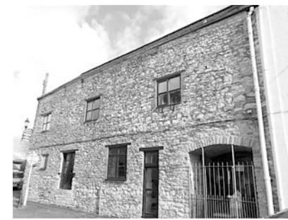
West Street Mill

Passing in front of this (if you can resist the temptations within) you will hear a rushing mill stream. Look through the long glass window to see the old mill wheel. The mill stream (originating from the Bishop's moat) flows on past Lidls, towards another mill at Keward, a few miles downstream. This mill began by grinding corn, next briefly turned to silk in the 1820s, then it was adapted to produce animal feed and fertiliser, before finally transforming into an antique shop.